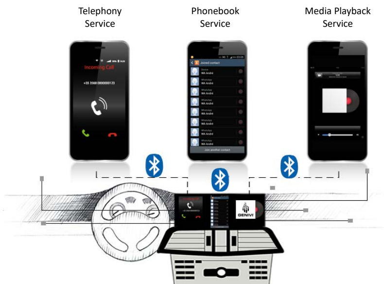
Fig.: Multiple phone connections are easily managed by Blue SDK RapidLaunch

Japan Ubiquitous AI Corporation Phone: +81 3 3493 7981 E-mail: sales@ubiquitous-ai.com Web: www.ubiquitous-ai.com